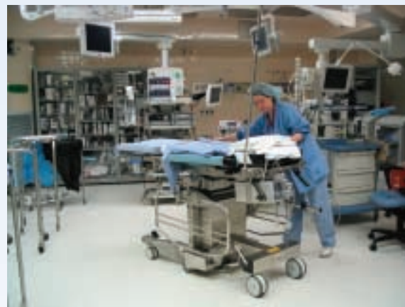
Above, top: The nurse's workstation in the OR of the Future features touch-screen controls.